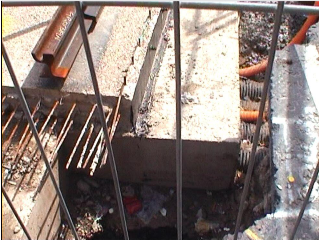
Massive track foundations in Nottingham (line 1)