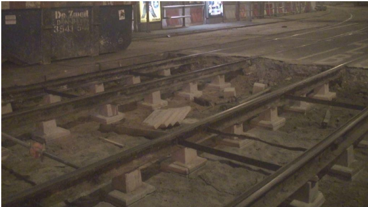
Simple track in Den Haag.

In The Netherlands, a very simple support of girder rail is used, see picture, in which concrete blocks support the rail, which themselves lie on larger area concrete slabs to take the load into the sub-soil, largely sandy in Holland. The void is in-filled, and the road surface brought up to railhead.