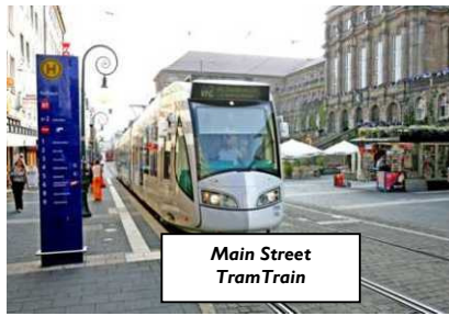
Main Street TramTrain